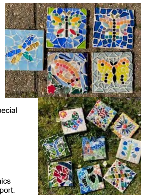
A selection of coasters made by participants

For further information see www.teachmecourses.co.uk , www.fifthcontinent.org.uk and www.romneymarshchurches.org.uk