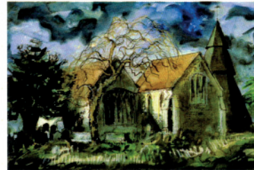
Also available: John Piper cards, pack of ten different illustrations, 105 x 148 mm, £3.00 per pack.

Published 2012 by the Romney Marsh Historic Churches Trust, 36 pages, 240 x 172mm, £3.50.